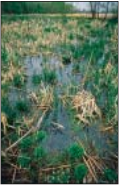
Four Illinois counties have more than 10% of their area covered by wetland.